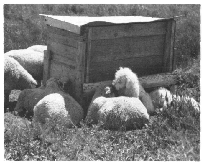
Two Komondor pups (4 months old) with sheep. Dogs are property of USDA-SEA.

ing dog questionnaire to more than 120 people who were reportedly using dogs to protect sheep and/or goats. Questionnaires were sent to 63 owners of Great Pyrenees in 25