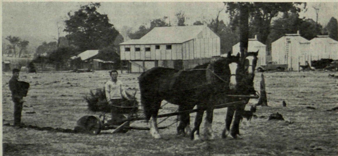
Experimental poisoning carried out with a horse-drawn shave plough and laying baits by hand

Apart from the danger of too much poisoned bait being left, it is impossible to over-poison a furrow for rabbits, but it is possible to under-poison.