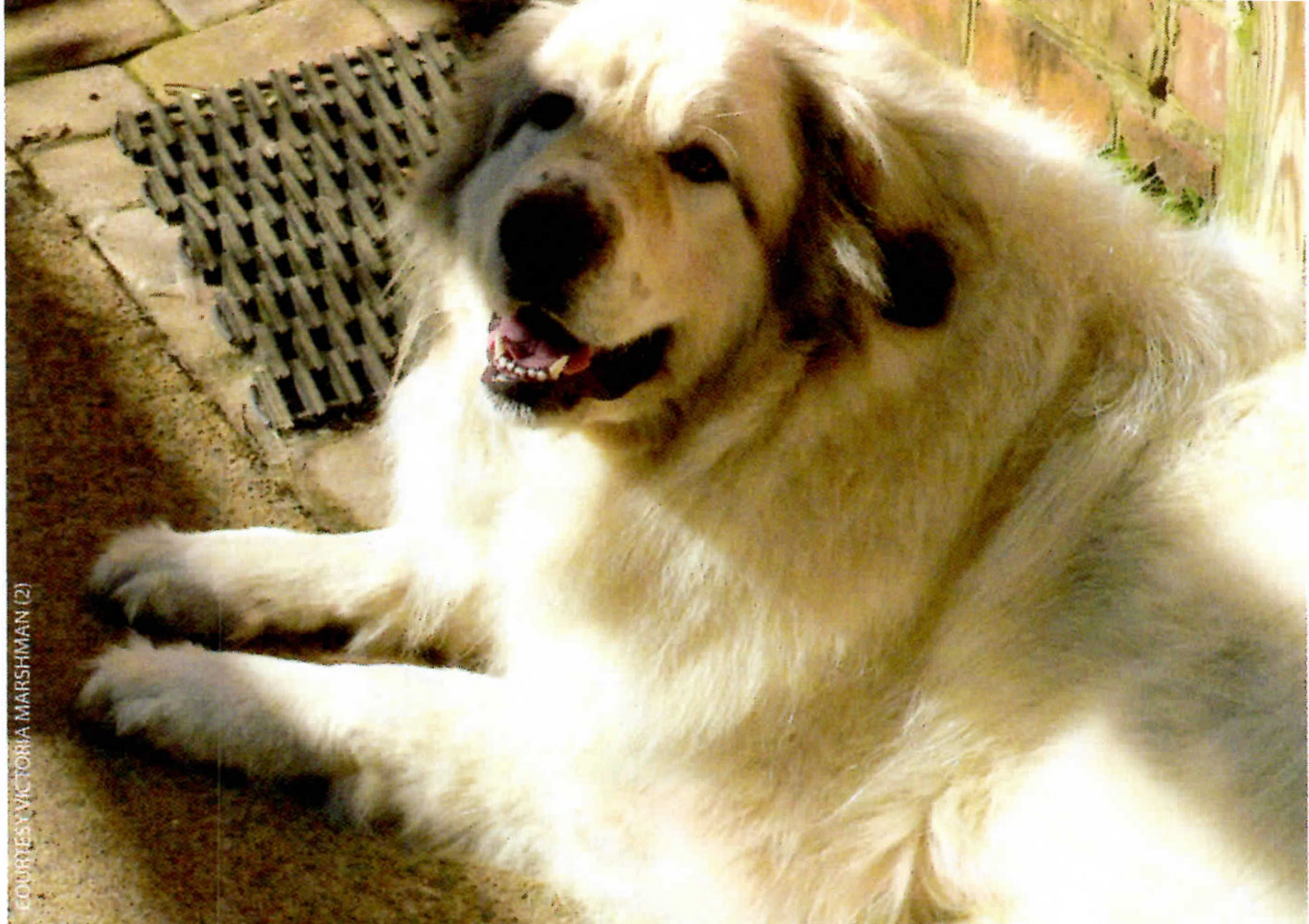
An LGD can be an asset to a small-scale farm, where fences and shelters might not be enough to keep livestock safe from predation.

Circle No. 196 on the Reader Service Card